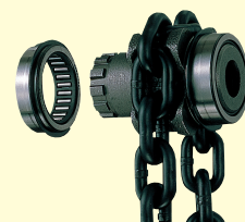
Needle bearings on load sheave