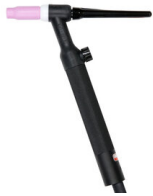
ST26V TIG TORCH AX50 4M 742058