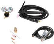
TIG WELDING KIT - ST26V 802491